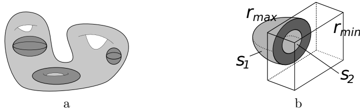
Figure 2: (a) 3D object with one connected component, three tunnels and three cavities. (b) Union of two regions r_{min} and r_{max} with in dark gray internal marked faces on r_{max} and in light gray, the two other surfaces s_1 and s_2 . In this case the merging of the two regions leads to the creation of a cavity associated to s_2 . s_1 is incident to the external surface of the union and thus does not lead to the creation of a new cavity.

The number of cavities b_2(r) of a region r is given by the number of included connected component of regions. The inclusion tree of regions is used to retrieve such information. An interesting property is that the number of surfaces of a region is equal to the number of cavities plus one. Indeed, for each cavity there is one internal surface and we have to count the external surface that is unique as there is only one connected component (in general the formula for the number of surfaces is b_2(r) + b_0(r) ).