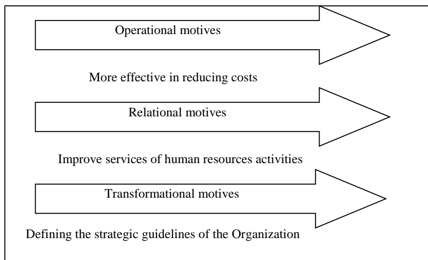
Figure 1: The motives of the integration of technology with HR

The motives of the integration of technology with HR are different and varied; it can be operational motives or relational motives or transformational motives, as shown in the following figure: