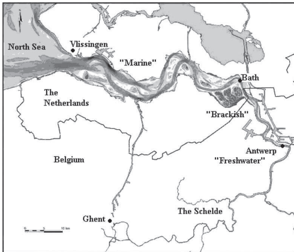
Fig. 1. Map of the Schelde estuary indicating the main salinity zones and the sampling stations. Vlissingen, Bath, Antwerp and Ghent are at km 0, km 57.5, km 78.5 and km 160, respectively.

Zooplankton were sampled monthly for two periods at a number of stations between Vlissingen (km 0) and Antwerp (km 78.5 from Vlissingen) (1989–1991), and between Bath (km 57.5) and Ghent (km 160) (1996–1998) (Figure 1). Bath, which is situated in the brackish water zone with a salinity range of 6–16 p.s.u., and Antwerp, with a salinity range varying between 0.5 and 6 p.s.u., were the only stations common to both sampling periods. During the first period, water was pumped at 2.5 m below the surface, 2.5 m above the bottom and poured over a 55 \mu\text{m} mesh to collect the zooplankton, which were subsequently fixed in a 4% formaldehyde solution. The samples were pooled and zooplankton were separated from heavier material using ludox prior to counting under a