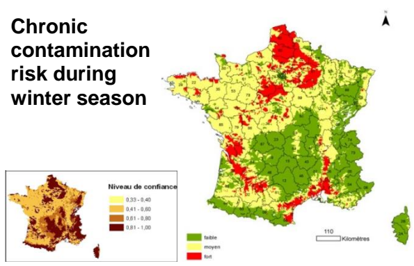
Figure 2 : Chronic contamination risk by pesticides in winter

Intermediary results as the maps of the environmental vulnerabilities are useful to understand causes of chemicals transfers. The final result discriminate water bodies status, as shown on figure 2. This method considers the different pesticides transfer processes and the relative environmental vulnerability which is an important determinant for risk assessment but rarely taken into account at the national level.