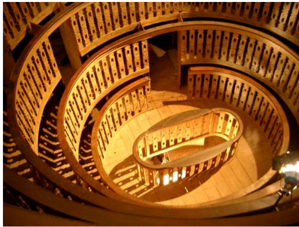
Figure 4. The anatomical theatre of Padua, built in 1595, remains standing today at the University of Padua, Italy.