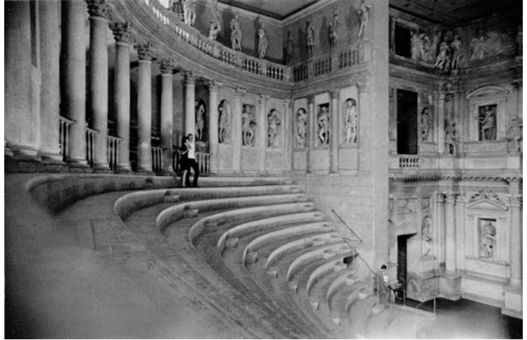
Figure 3. The Teatro Olimpico of Vicenza, built in 1585 in Italy.

Aside from Estienne’s concern about managing his audience and overseeing the proceedings of the spectacle, he considered that the public anatomies were part of a series of events that should be offered to “the people” ( vulgo proponenda ). That is to say, he placed an emphasis on the importance of a heterogeneous audience, not limited to doctors and students, which included people from outside the university milieu. Félix Platter reports that at the 14 November 1552 dissection of the boy who died from the abscess in his chest, in addition to students “there were many from the nobility and the bourgeoisie in the audience, and even a