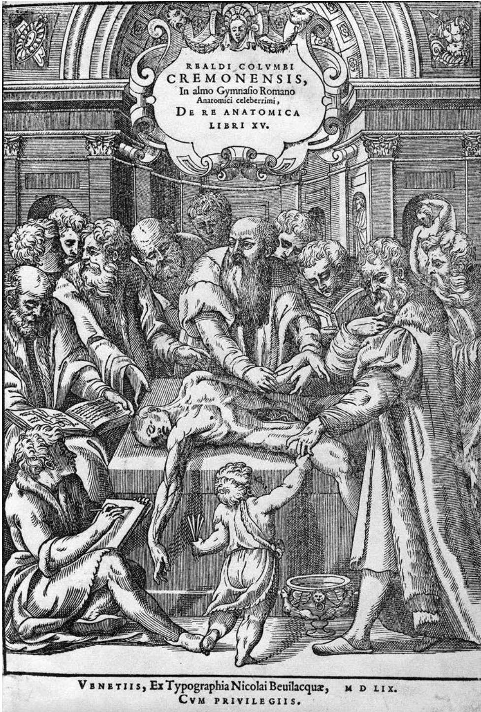
Figure 6. The frontispiece of Realdo Colombo's De re anatomica . The engraver is unknown, possibly Paolo Veronese (1528–1588). (In Colombo 1559)