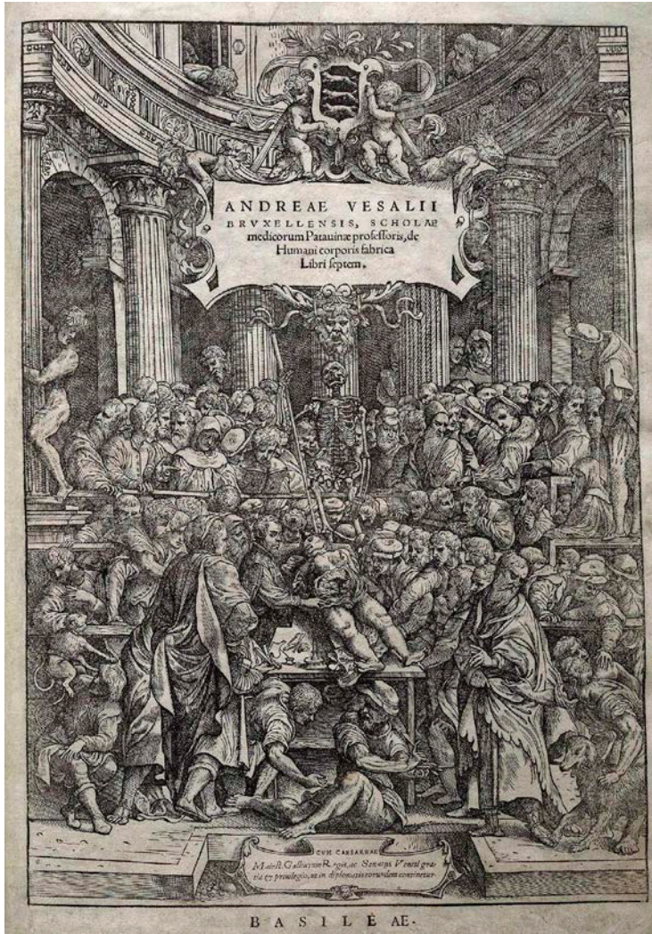
Figure 5. The frontispiece of Andreas Vesalius' De humani corporis fabrica shows a public dissection in an ideal amphitheater, rather than depicting an actual one. The engraver is unknown, probably the Flemish artist Jan Steven van Calcar (d. 1545–46). (In Vesalius 1543)

procedure gradually descended into the body's interior. In order to realize these operations, anatomists used a series of instruments, the principal ones being, of course, knives, razors, and other blades. In order to properly cut the segments, wrote André Du Laurens (1558–1609), one must have available the appropriate instruments, notably "razors of all kinds": large, small, mid-sized, straight and curved, oblong, pointy, of varying lengths, made of bronze, silver, lead, as well as wood and ivory (Du Laurens 1600:22). The anatomist, Estienne clarifies, must know how to use these instruments with the dexterity necessary to allow him to turn lightly and easily from the cutting to the blunt side, this last serving to "separate the skin," whereas the handle of the knives was used to divide the muscles and the membranes (Estienne 1545:344).