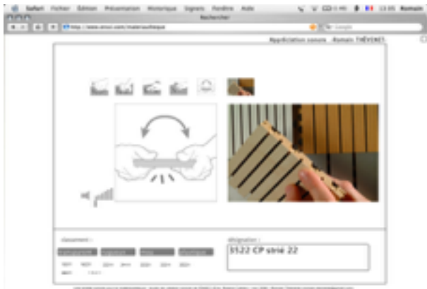
figure 5 Une

In this paper, I will go through some of the fields for which there is a real need for specialist sound-designers or designers with a greater understanding of sound. 11 To do this, I will start by giving some examples of areas where sound can be a crucial way for objects to fulfil their industrial functions and therefore cannot be excluded from the Design process. I will then explain some motifs in Sound-Design and demonstrate how their execution requires specialist knowledge. From this discussion I will turn to the role of Education and teaching as a drive for innovation in industry and Design: the beginning of this virtuous circle.