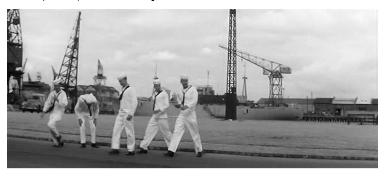
Figure 2 - Lola, J.Demy 1961

To understand the image of a city, the ambiance, one can look at postcards, tourist guides or cinema. Cinema is a good way to see how a city is perceived from a cinematographer point of view, it often reflects what is really in the air, positive or not. Let's take Rome, for instance, after the war, it was a desperate city and films like "Roma città aperta" (Roberto Rossellini 1945) or "Ladri di biciclette" (Vittorio De Sica, 1948) show a postwar Rome of poverty and violence. In "Roman Holiday" (William Wyler 1953), the atmosphere is lighter, the sun shines, the characters ride through famous places. Woody Allen in "To Rome with Love" (2012) shows the eternal city, it's a tourist postcard, an open-air museum. A lot of films are also shot in France. If Nantes is not as famous as Paris or Nice or Marseille for filmmaking, about 20 films were shot since the end of the Second World War. Famous movies like "Lola" or "une chambre en ville" by Jacques Demy, created a fictional reality that visitors wanted to find. "Lola" filmed in 1961 shows Nantes as a city of cranes, with a strong shipyard and a dense industrial activity. Docks are full of strong guys, ready for a fight, prostitutes and lost girls. The harbour is certainly not the place to walk the dog.