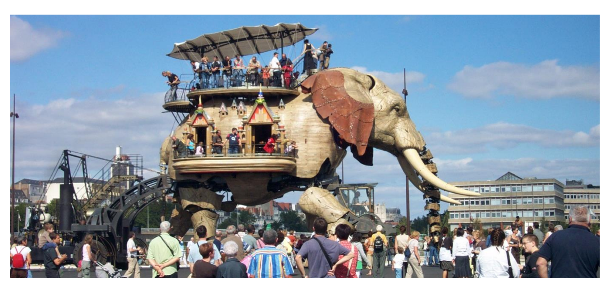
Figure 9 - the new elephant

The inhabitants of Nantes become familiar with bold shapes, modern architectures and even adopt a wooden elephant around which they flock in mass on Sundays and public holidays. Have we forgotten the cranes, certainly a bit, they are heritage, they denote the harbour from the past or a Steampunk image accompanying the mechanical creatures? The island of Nantes took its autonomy and is no longer the bulky part of the city, but rather the opposite, it becomes its motor, its inspiration. Ten years and one struggles to imagine that this place could be otherwise, old images become blurred, fade, one could hardly remember what was there before the elephant station, before the renewal. The city of cranes, Nantes became a city of the elephant, before the industrial city, it became a city of culture.