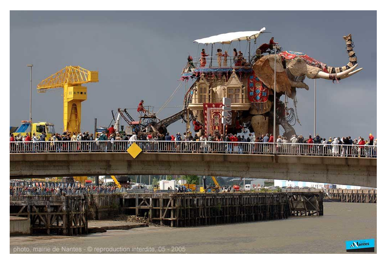
Figure 8 - The first elephant

Following the regeneration of Bilbao, with its iconic museum, it was possible to imagine that culture could add value to a city looking for a second wind. In the early years of the new century, the growing use of the internet and computers have brought prosperity and economic growth to the city of Nantes. But it also turned out that street theatre, and particularly the wooden Elephant, has encouraged more people to visit Nantes, some even to stay, and the residents to love their city. This, in turn, has improved the economy with the influx of new talents.