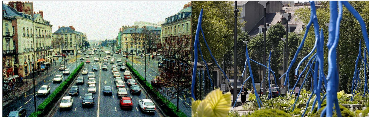
Figure 5 – Before the renovation, the flow of cars.