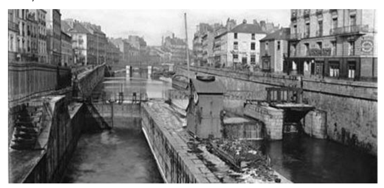
Figure 4 - Before the filling of the Erdre

In December 1992, architect Dominique Perrault conducted an exploratory study and drawn major principles of intervention for the city of Nantes (Perrault & Grether, décembre 1992). In his chapter called "Method", the architect considers unrealistic to establish a general plan for the development of a vast territory. Interventions must register "different and concurrent" topics without hierarchy. He suggested promoting new installations, connections, and participation. Before 2000, Nantes didn't develop by strata, by layer, with a new sheet covering an old one. Each period had conquest a new territory developed it or abandoned it. This resulted in a very strong sectorization with virtually sealed borders and striking contrasts of scale. As a consequence, industrial sites, located in the inner centre of the island of Nantes, turned to lost areas, dangerous zones. It was a dead spot in the very centre of the city.