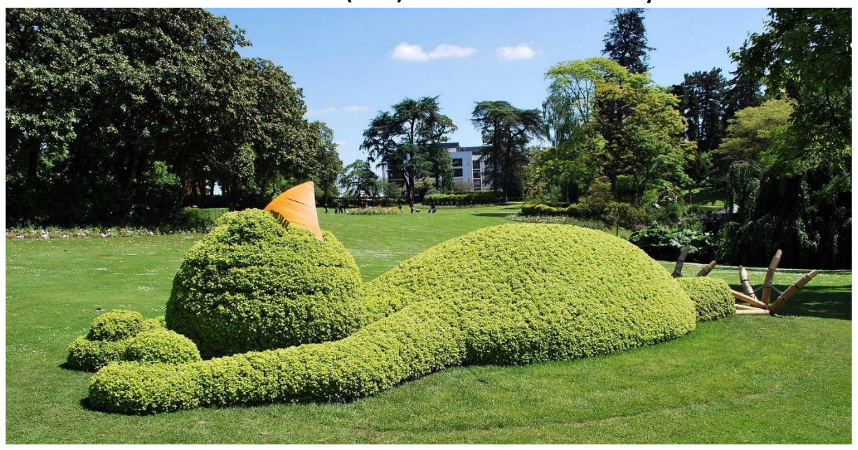
Figure 1 - Conception : Service des Espaces Verts et de l'Environnement (SEVE) Nantes