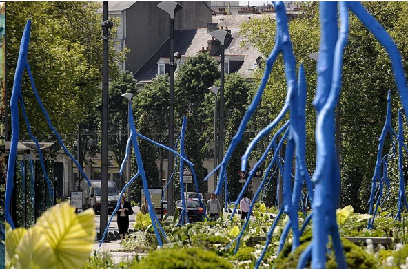
Figure 6 – today's situation

Let's understand the situation. In the western part of the island, huge industries left big empty spaces. In the centre part, old housing was held by poor families and in the eastern part, new housing seemed