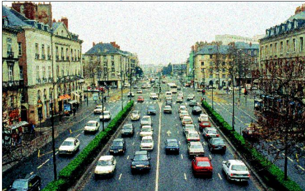
Figure 5 – Before the renovation, the flow of cars.