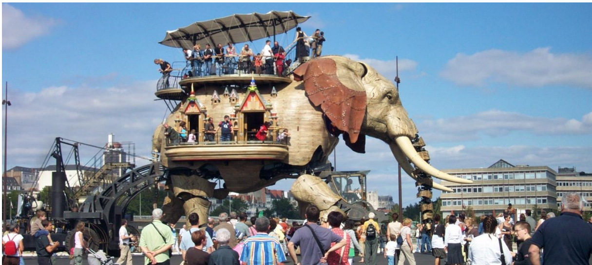
Figure 9 - the new elephant

The inhabitants of Nantes become familiar with bold shapes, modern architectures and even adopt a wooden elephant around which they flock in mass on Sundays and public holidays. Have we forgotten the cranes, certainly a bit, they are heritage, they denote the harbour from the past or a Steampunk image accompanying the mechanical creatures? The island of Nantes took its autonomy and is no longer the bulky part of the city, but rather the opposite, it becomes its motor, its inspiration. Ten years and one struggles to imagine that this place could be otherwise, old images become blurred, fade, one could hardly remember what was there before the elephant station, before the renewal. The city of cranes, Nantes became a city of the elephant, before the industrial city, it became a city of culture.