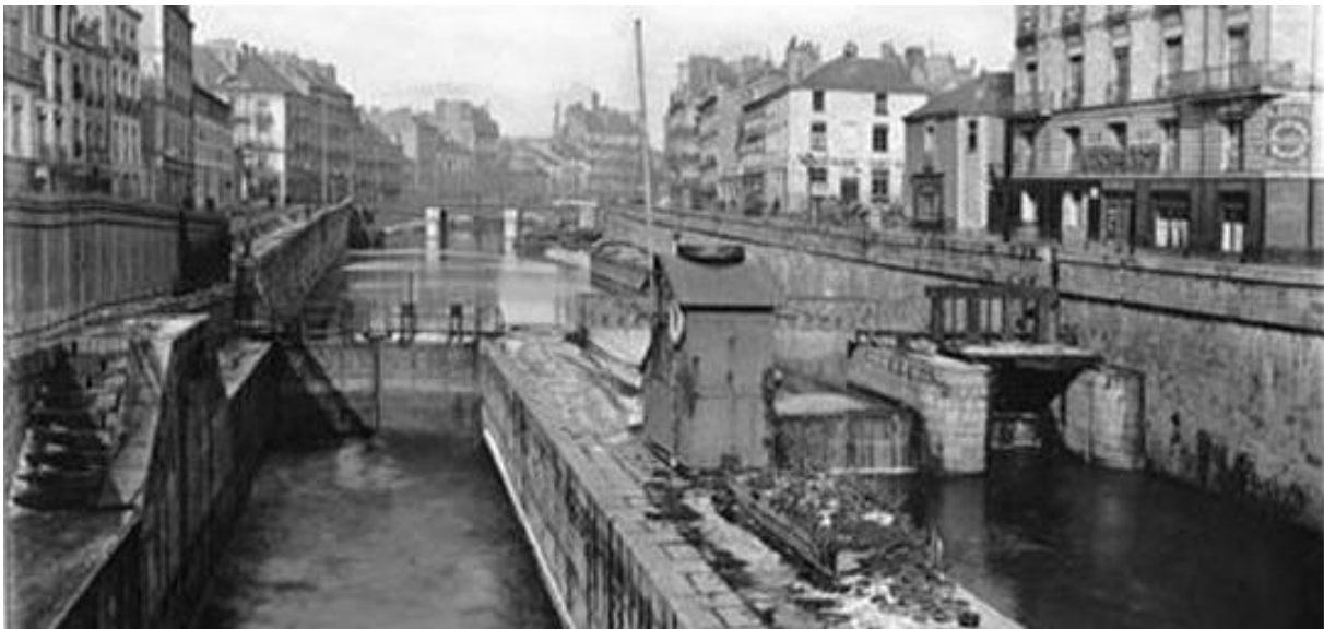
Figure 4 - Before the filling of the Erdre

In December 1992, architect Dominique Perrault conducted an exploratory study and drawn major principles of intervention for the city of Nantes (Perrault & Grether, décembre 1992). In his chapter called "Method", the architect considers unrealistic to establish a general plan for the development of a vast territory. Interventions must register " different and concurrent " topics without hierarchy. He suggested promoting new installations, connections, and participation. Before 2000, Nantes didn't develop by strata, by layer, with a new sheet covering an old one. Each period had conquest a new territory developed it or abandoned it. This resulted in a very strong sectorization with virtually sealed borders and striking contrasts of scale. As a consequence, industrial sites, located in the inner centre of the island of Nantes, turned to lost areas, dangerous zones. It was a dead spot in the very centre of the city.