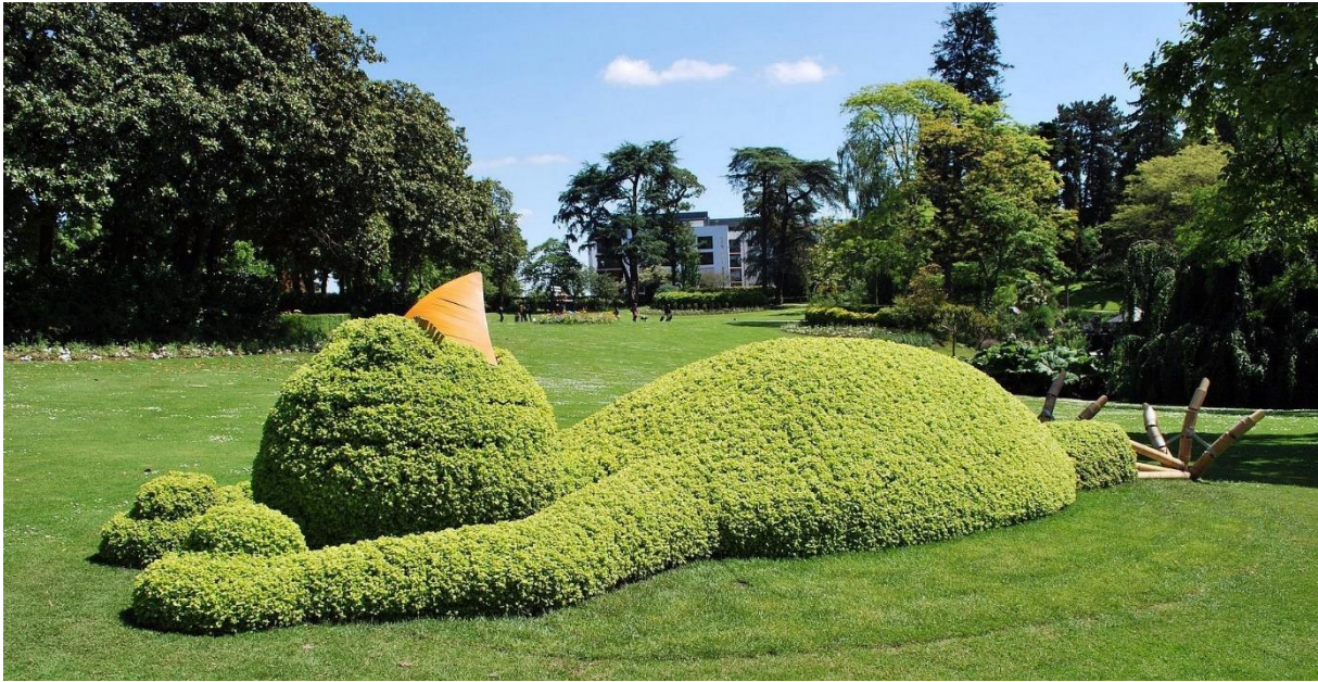
Figure 1 - Conception : Service des Espaces Verts et de l'Environnement (SEVE) Nantes