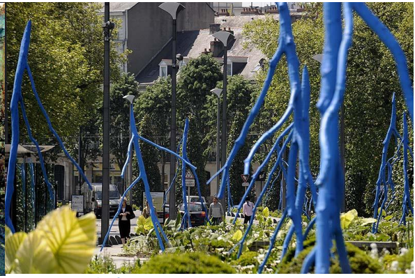
Figure 5 – today's situation

Let's understand the situation. In the western part of the island, huge industries left big empty spaces. In the center part, old housing was held by poor families and in the eastern part, new housing seemed so desperate that the only wish there, was to leave as soon as possible. The island was cut into three parts by a large and fast motorway that brought people living in the south part of the city directly in the center. Perrault's answer was too vague about what to do with this bulky industrial past and out of date Urbanism. We've seen that cinema showed Nantes as a city of cranes. For the inhabitants, the image of their own city was more blurry. A large investigation has been made in order to determine the way to the Island of Nantes was perceived. As a matter of surprise, a great majority didn't know that the Island is one island. A lot of people thought that it was still a collection of small islands as Neighborhoods' names suggest it. In the enquiries, somebody said that he cannot walk the dog round the island, so it can't be true. The eastern part of the Island is called Beaulieu. It's an important dwelling area. For a three quarter of the inhabitants, it was a transitory place and 70 % of them were moving away within a period of six months. As often advocate architects, offices were mixed with housing with a result of a feeling of not being in a private area.