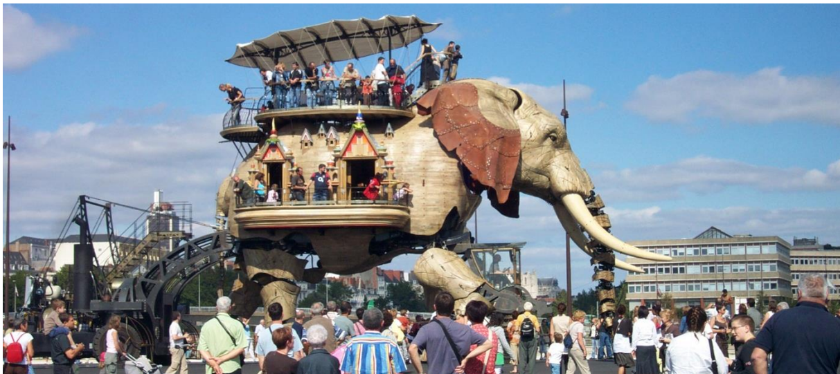
Figure 8 - the new elephant

The inhabitants of Nantes become familiar with bold shapes, modern architectures and even adopt a wooden elephant around which they flock in mass on Sundays and public holidays. Have we forgotten the cranes, certainly a bit, they are heritage, they denote the harbor from the past or a Steampunk image accompanying the mechanical creatures. The island of Nantes took its autonomy and is no longer the bulky part of the city, but rather the opposite, it becomes its motor, its inspiration. Ten years and one struggles to imagine that this place could be otherwise, old images become blurred, fade, one could hardly remember what was there before the elephant station, before the renewal. The city of cranes, Nantes became a city of the elephant, before industrial city, it became a city of culture.