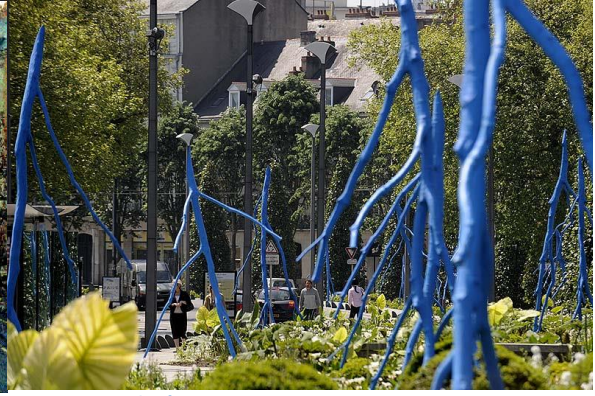
Figure 5 – today's situation

Let's understand the situation. In the western part of the island, huge industries left big empty spaces. In the center part, old housing was held by poor families and in the eastern part, new housing seemed so desperate that the only wish there, was to leave as soon as possible. The island was cut into three parts by a large and fast motorway that brought people living in the south part of the city directly in the center. Perrault's answer was too vague about what to do with this bulky industrial past and out of date Urbanism. We've seen that cinema showed Nantes as a city of cranes. For the inhabitants, the image of their own city was more blurry. A large investigation has been made in order to determine the way to the Island of Nantes was perceived. As a matter of surprise, a great majority didn't know that the Island is one island. A lot of people thought that it was still a collection of small islands as Neighborhoods' names suggest it. In the enquiries, somebody said that he cannot walk the dog round the island, so it can't be true. The eastern part of the Island is called Beaulieu. It's an important dwelling area. For a three quarter of the inhabitants, it was a transitory place and 70 % of them were moving away within a period of six months. As often advocate architects, offices were mixed with housing with a result of a feeling of not being in a private area.