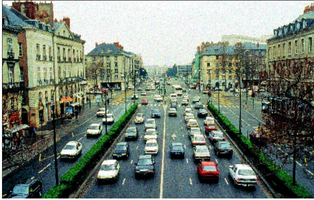
Figure 4 – Before renovation, flow of cars.