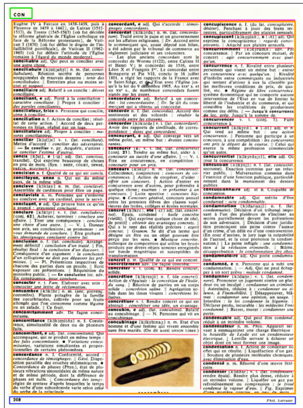
Figure 1: First and second segmentation levels of a dictionary page [5]