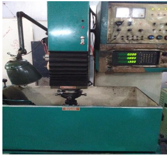
Fig. 1. Die sinking EDM Machine.