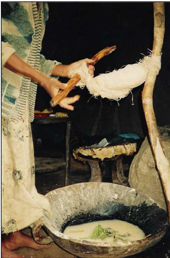
Picture 13. A woman squeezing unwanted acidic water out of the fermented enset food ( waasa ). For this purpose the waasa is wrapped into a sack. One end of this sack is then fixed on a pole. The other end is wrapped around a stick. The woman turns the stick until all the water has dripped out of the waasa .

Kult xooffoohanniichch zakkiin lamessa xawanka nubaabus zahhiccit agurt lamessa hagaranka xuudiin mooshshitoou. Xone qallut manchut gagisebii ihumbuu qophphananka woleanta mancho beetu gagisebii ecciteetannee ikkayyoosigu qishixxu yoobaiganeent ikke. Hikkanniichch zakkiin tiiphisin beetuse rehumbusee “Reheeu,” yamantaa manchut ammoo reheeihu ise beetu