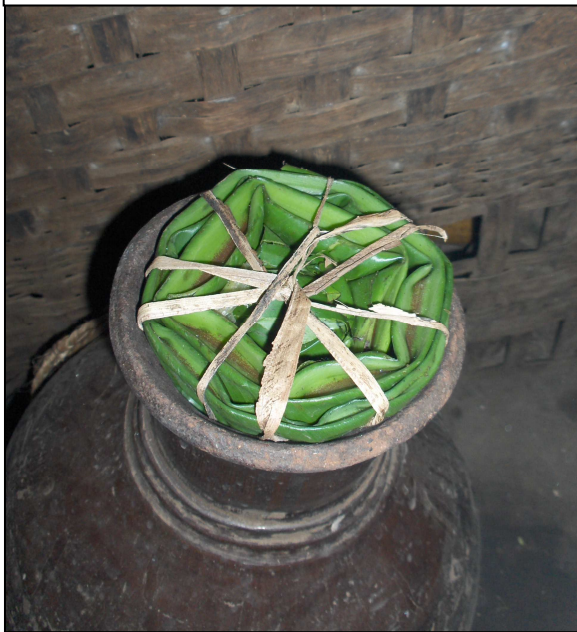
Picture 9. Stopper ( tuphaanchuta ) for a pot, made from a folded enset leaf and a thin enset cord.

“Birseen ke’een caa’mmas gobii gogus mooluntanee arriichchoon tollu hasisano,” yitoou. Ka goga ammoo tollit ke’eechch mooshshitoou. Isiichch zakkiin “Teesu ammoo gobotanneha ku gogu siichchu hasisanos,” yit “Laga massi siichchisu hasisano,” yitooii laga massitoou. Laga wou yooba massit lagaantasin ammoo xillimat yoo ma’nnita hass agurt gogas woan wortoou.