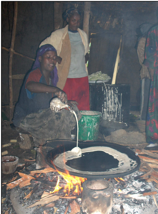
Picture 1. Woman pouring dough with a calabash ( bulita ) onto the griddle ( mixaadu ) in order to prepare injeera for a holiday.