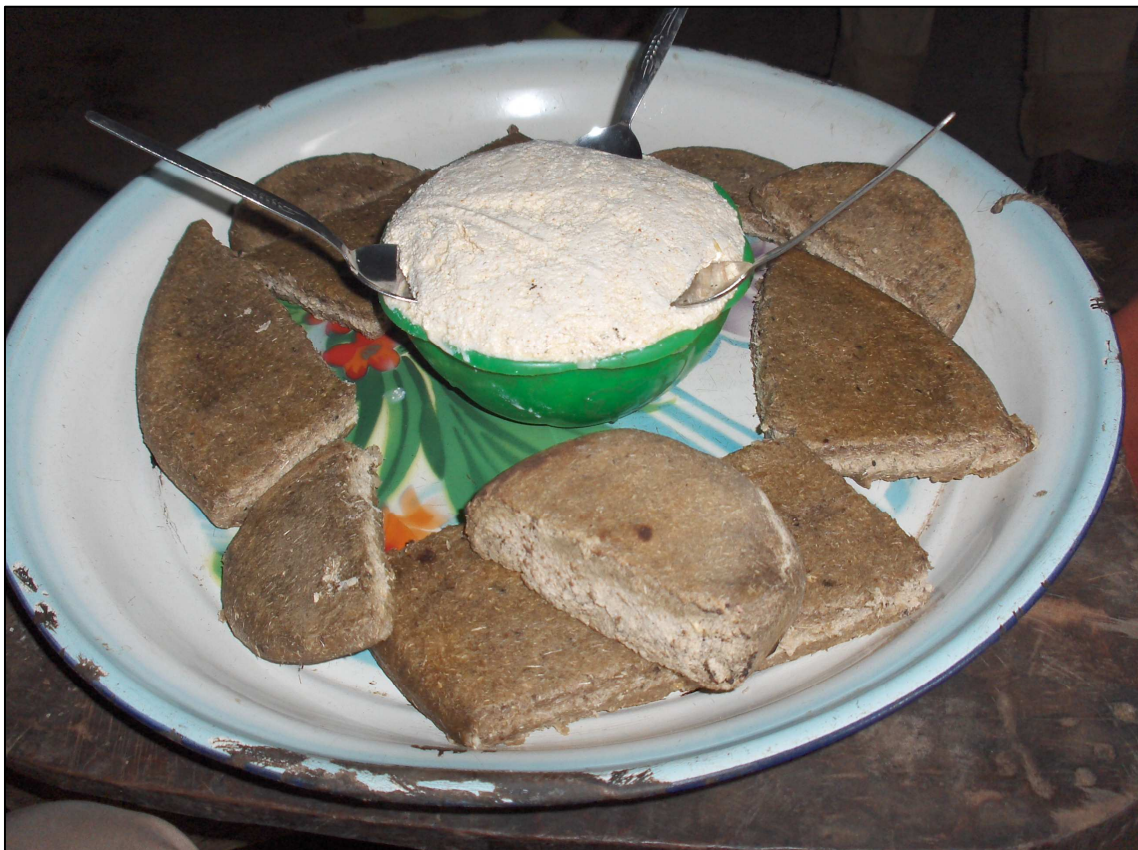
Picture 8. Large plate with a dish of white cheese ( wojju qeesa ) and enset bread ( qambuta ).