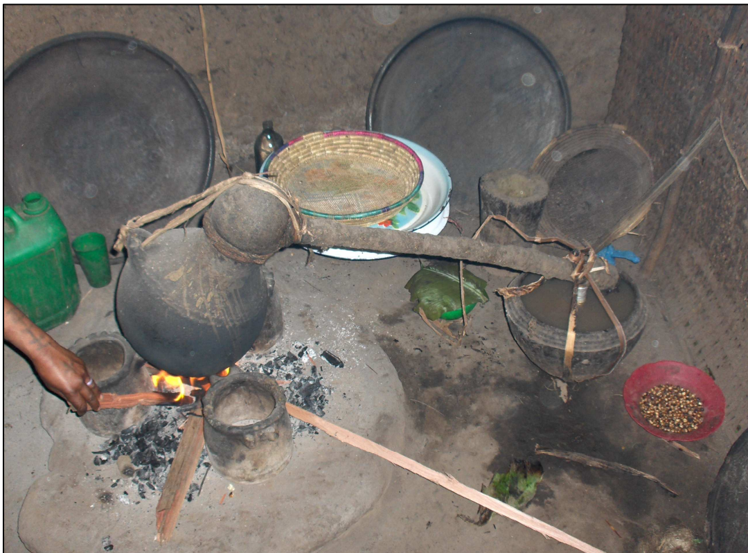
Picture 3. Distillation equipment for local brandy ( baraqita ). The clay pot ( boosu ) on the fire (on the left) contains the fermented grain mash. On the opening of the boosu -pot another small pot ( we'eesaamita ) is fixed upside down. Through a tube ( masaafa ), the pot is connected with an aluminium bottle ( kodda ), in which the distilled brandy is collected. The aluminium bottle is not visible on the picture, because it is immersed in the cooling water in the bowl ( mada ) to the right.