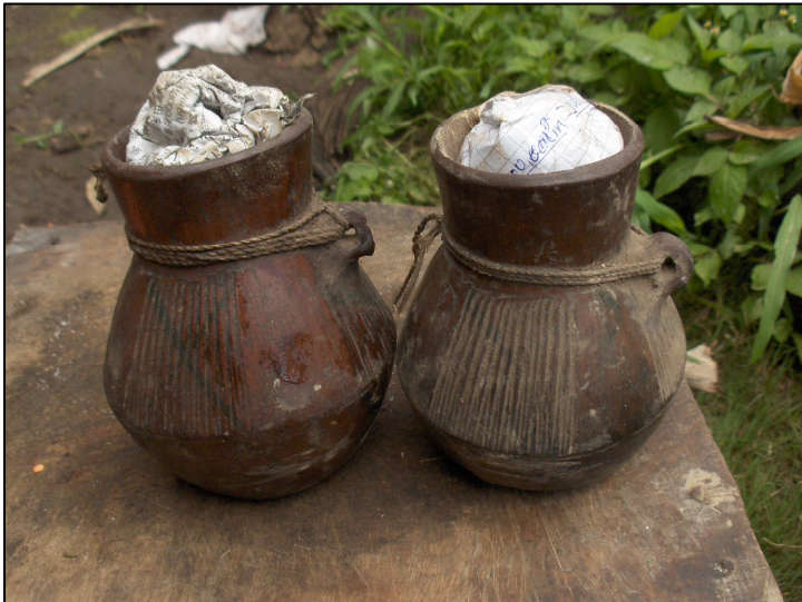
Picture 11. Small clay vessels ( xenqellata ) used, among others, to drink milk.