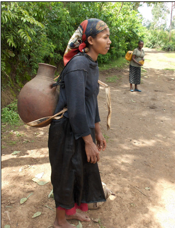
Picture 12. Kambaata girls coming from the well. The girl in the front carries a clay water-pot ( boosu ) on her back, the girl in the back a plastic jerrican.

sanutaa afoojaa iffisamm urubamubogga sanosina afeesi hegeegiichch oddiishshata qaart kant orootoo. Lankisibiitii ikkoodaa beetuse ossiissaa jaata taega qoorata ihu hooggootannee ciilise sanutaa afoojaa fooshsha fanqashshaqqumbogga iffiss urubbaa oddiishshata qaart kantu'naan agurt hujeseba orootoo. Isen dikkuta martooiita birsit kei hujesebeechch fanqalt waalt ciilase gishsho beechchiichch qansitota baqq aii xuuddaada sanus oddiishshat urubb fooshsha fanqashshaqqu kantiyan rehi fajjeuu. Taaph wonaa ossiisoo qoorata mancho beetu rehu'naanin fooliin in yoo. Hikkannii ciiluse rehee manchut ise rehee ciila taaph mancho foolaamua ciiliin massit doort agurt kai ma'neen ossiisoo. Osiissoohanniichch zakkiin ise ammoo foolaamu ciila gagisebiiha eccit hanqaphhit agurt qansitan egerteeu.