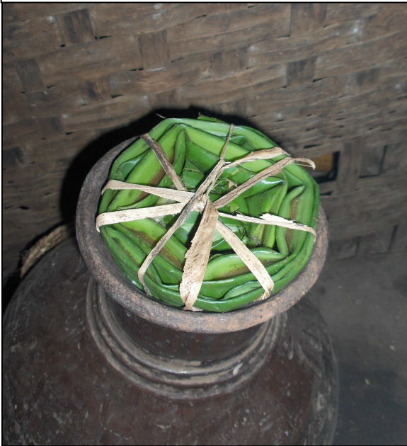
Picture 9. Stopper ( tuphaanchuta ) for a pot, made from a folded enset leaf and a thin enset cord.

“Birseen ke’een caa’mmas gobii gogus mooluntanee arriichchoon tollu hasisano,” yitoou. Ka goga ammoo tollit ke’eechch mooshshitoou. Isiichch zakkiin “Teesu ammoo gobotanneeha ku gogu siichchu hasisanos,” yit “Laga massi siichchisu hasisano,” yitooii laga massitoou. Laga wou yooba massit lagaantasin ammoo xillimat yoo ma’nnita hass agurt gogas woan wortoo.