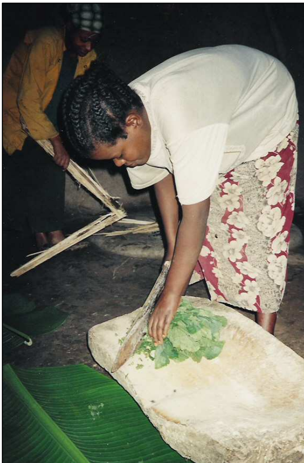
Picture 4. Girl cutting cabbage ( hamiilu ) on a big wooden board ( gonga ).