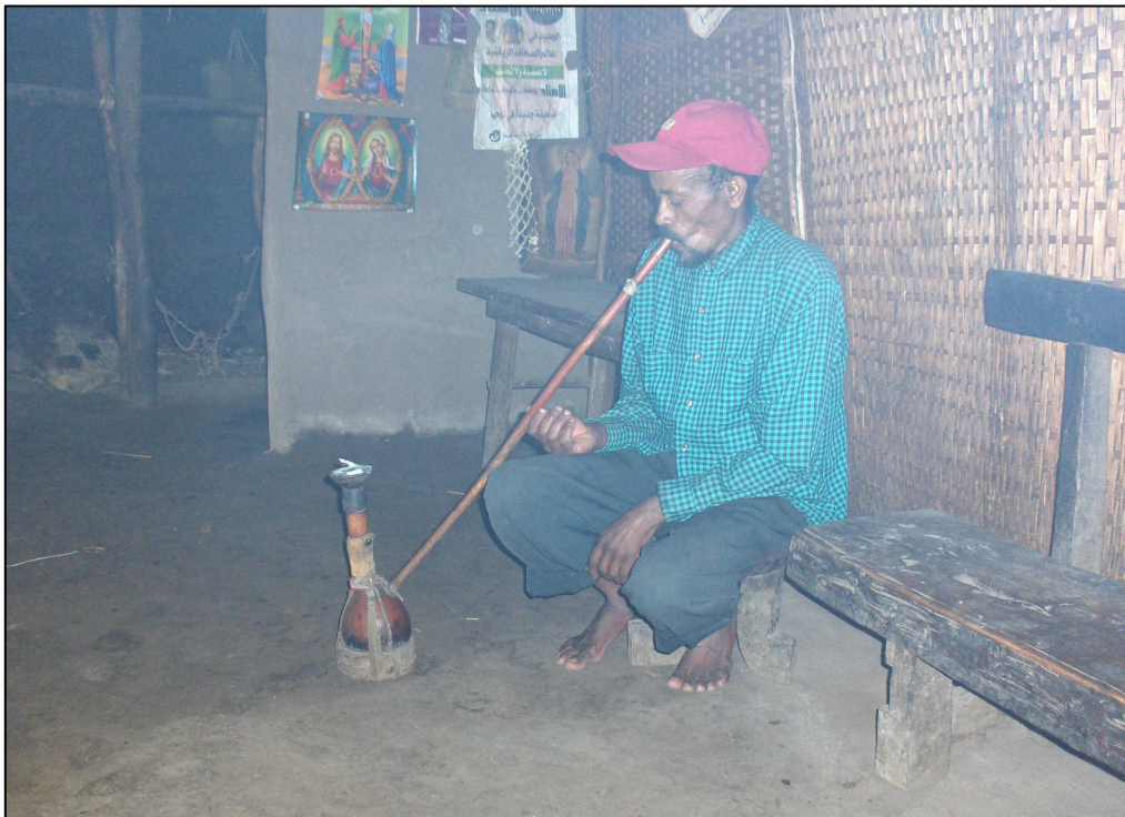
Picture 5. Kambaata man smoking his water-pipe ( gaayyata ) in the front room ( gaxa ) of his house.