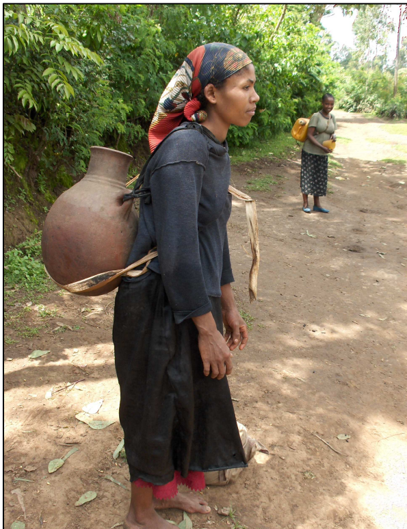
Picture 12. Kambaata girls coming from the well. The girl in the front carries a clay water-pot ( boosu ) on her back, the girl in the back a plastic jerrican.

sanutaa afoohaa iffisamm urubamubogga sanosina afeesi hegeegiichch oddiishshata qaart kant orootoo. Lankisibiitii ikkodaa beetuse ossiissaa jaata taega qoorata ihu hooggootannee ciilise sanutaa afoohaa fooshsha fanqashshaqqumbogga iffiss urubbaa oddiishshata qaart kantu'naan agurt hujeseba orootoo. Isen dikkuta martooiita birsit kei hujesebeechch fanqalt waalt ciilase gishsho beechchiichch qansitota baqq aii xuuddaada sanus oddiishshat urubb fooshsha fanqashshaqqu kantiyan rehi fajjeuu. Taaph wonaa ossiisoo qoorata mancho beetu rehu'naanin fooliin in yoo. Hikkannii ciiluse rehee manchut ise rehee ciila taaph mancho foolaamua ciiliin massit doort agurt kai ma'neen ossiisoo. Osiissoohanniichch zakkiin ise ammoo foolaamu ciila gagisebiiha eccit hanqaphhit agurt qansitan egerteeu.