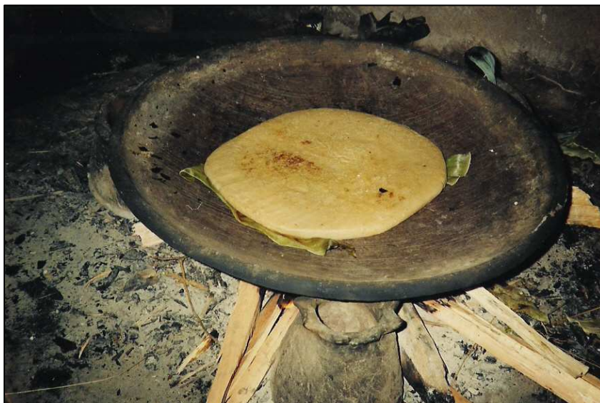
Picture 14. Ensete bread ( qambuta ) being baked on the griddle ( mixaadu ).