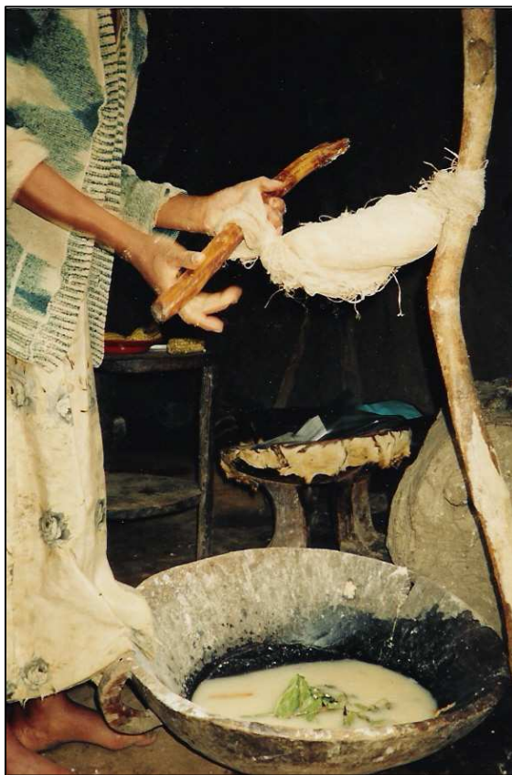
Picture 13. A woman squeezing unwanted acidic water out of the fermented enset food ( waasa ). For this purpose the waasa is wrapped into a sack. One end of this sack is then fixed on a pole. The other end is wrapped around a stick. The woman turns the stick until all the water has dripped out of the waasa .

Kult xooffoohanniichch zakkiin lamessa xawanka nubaabus zahhiccit agurt lamessa hagaranka xuudiin mooshshitoou. Xone qallut manchut gagisebii ihumbuu qophphananka woleanta mancho beetu gagisebii ecciteetannee ikkayyoosigu qishixxu yoobaiganeent ikke. Hikkanniichch zakkiin tiiphisin beetuse rehumbusee “Reheeu,” yamantaa manchut ammoo reheeihu ise beetu