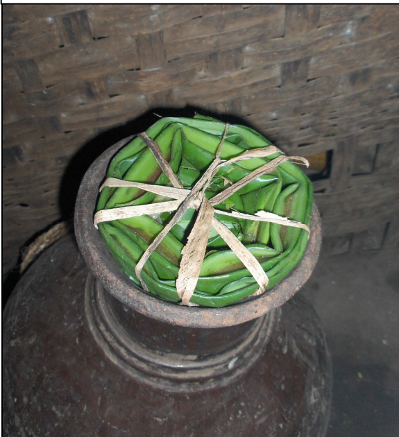
Picture 9. Stopper ( tuphaanchuta ) for a pot, made from a folded enset leaf and a thin enset cord.

“Birseen ke’een caa’mmas gobii gogus mooluntanee arriichchoon tollu hasisano,” yitoou. Ka goga ammoo tollit ke’eechch mooshshitoou. Isiichch zakkiin “Teesu ammoo gobotanneeha ku gogu siichchu hasisanos,” yit “Laga massi siichchisu hasisano,” yitooii laga massitoou. Laga wou yooba massit lagaantasin ammoo xillimat yoo ma’nnita hass agurt gogas woan wortoo.