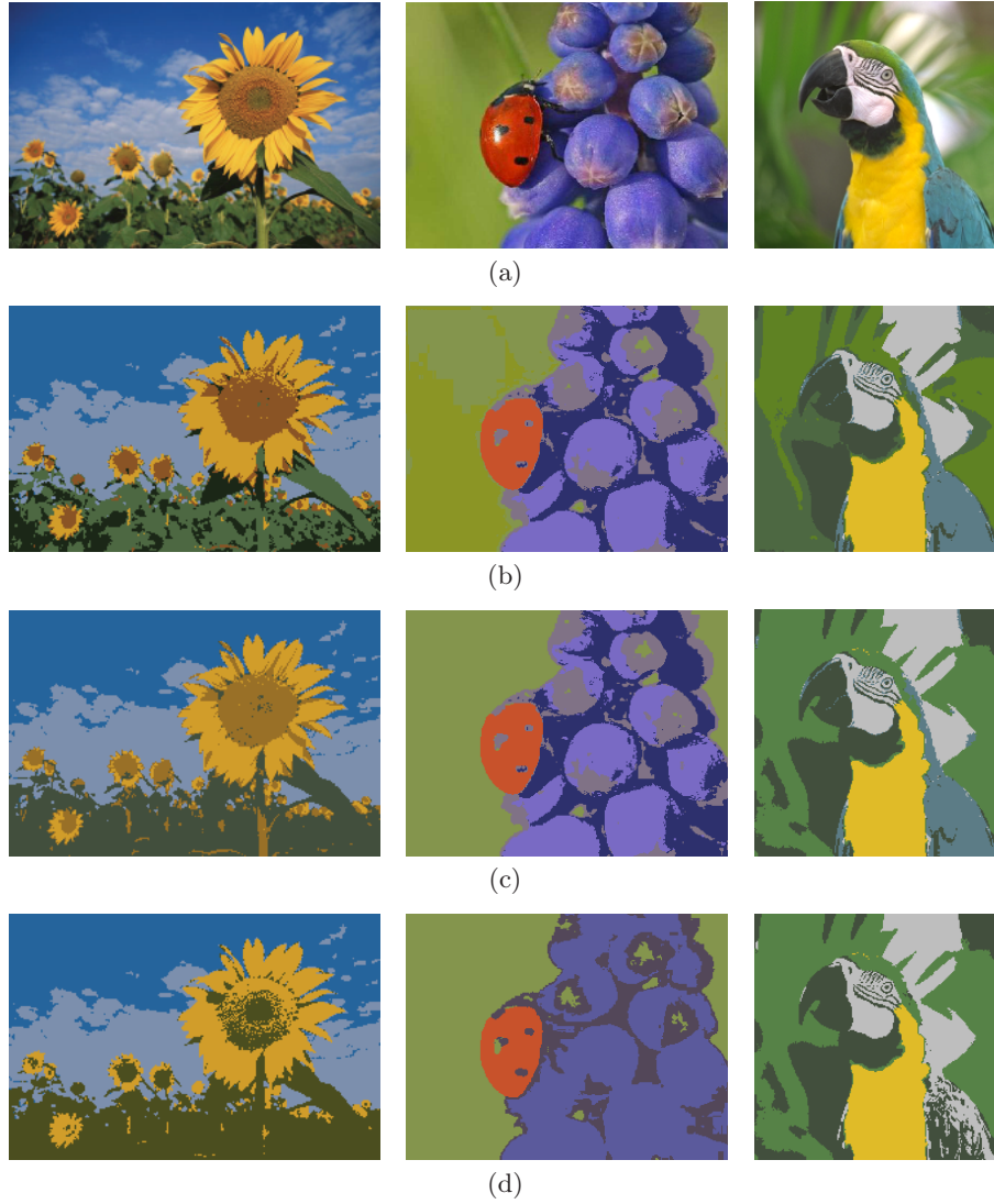
Fig. 3. In (a), original sunflower , ladybug , parrot images y , of size 254 \times 168 , 298 \times 228 , and 200 \times 199 , respectively. In (b)–(d), quantized images x solution to (12) ( \lambda = 0 ) and (4), with K = 6 , K = 5 , K = 4 , respectively, with the palette \Gamma of candidate colors shown in Fig. 2.