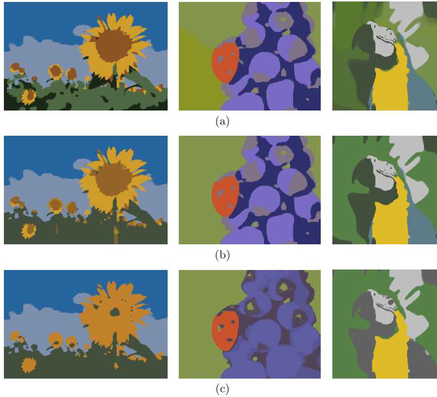
Fig. 4. Segmented images x , solution to (12) and (4), with y in Fig. 3 (a), \lambda = 500 , and the palette \Gamma of candidate colors shown in Fig. 2. In (a), (b), (c), K = 6 , K = 5 , K = 4 , respectively.