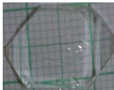
Fig. 2. Crystal of 0.8wt% L-Serine doped ADP.

(2) For the growth of non- linear optical (NLO) material ADP crystals and doping with different amount of amino acid L-Serine, the slow solvent evaporation method was used. For the growth of L-serine doped ADP crystals the different amount of L-serine, i.e., 0.4 wt %, 0.6 wt % and 0.8 wt %, was added in ADP solution. The confirmation of successful doping was obtained from FTIR spectroscopy studies. The details are given by Joshi et al [20]. Figure 2 shows the type of crystal grown.