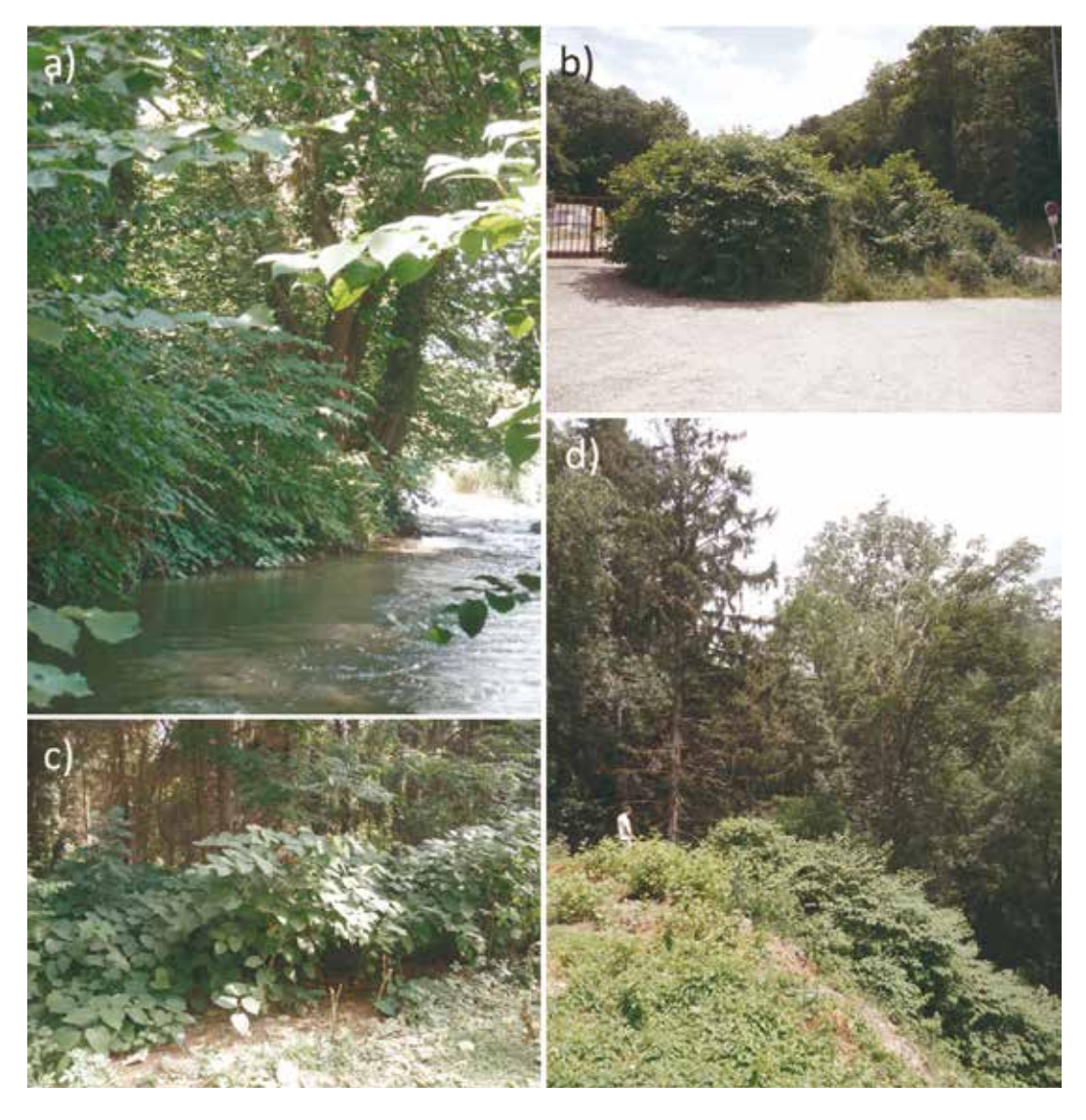
Figure 53. Asian knotweeds thrive in a broad range of environments: (a) along rivers; (b) in urban areas; (c) along forest edges; and (d) in wild garden waste.

Dommanget et al. (2014) demonstrated that the growth of three species with potential for restoration – e.g. black poplar ( Populus nigra L.), grey willow ( Salix atrocinerea Brot.) and osier ( Salix viminalis L.) – was noticeably reduced when watered with leachates from soil in which Japanese knotweed was growing.