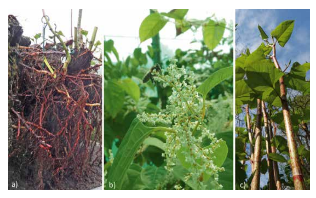
Figure 52. Underground system (a), flowers (b) and growing ramets (c) of Fallopia japonica.

If sexual reproduction also occurs in the wild (Forman and Kesseli 2003), Asian knotweeds' reproduction is mostly vegetative, especially in Japanese knotweed for which only one male-sterile clone has been identified in Europe (Krebs et al. 2010) and only four in the USA (Gammon and Kesseli 2010). Giant knotweed and hybrid knotweed have a more complex genetic variability (Hollingsworth et al. 1999) as sexual reproduction exists between Japanese and giant knotweeds and between the hybrid and its two parents (Tiébré et al. 2007). But vegetative reproduction is very efficient as it only takes a small fragment of a rhizome (Sásik and Eliáš Jr 2006) or stem to produce a new individual (Bímová et al. 2003). Small white flowers appearing in summer from July to September (Figure 52) are situated in terminal and axillary panicles and are pollinated by insects (Beerling et al. 1994). Asian knotweeds produce achenes of variable viability depending on the clone (e.g. Buhk and Thielsch 2015) that spread along rivers thanks to their good buoyancy and ability to germinate after immersion (Rouifed et al. 2011). The propagules disperse via e.g. watercourses (Bímová et al. 2004) or through construction vehicles (Rouifed et al. 2014) or backfill materials (Beerling 1991).