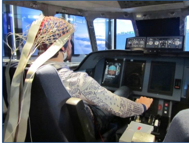
Fig. 1. Illustration of a participant in the flight simulator.

Oddball Sounds. One of two 50 dB (SPL) tone types lasting 100 ms was randomly played. The tone was either standard (frequency = 1900 Hz, p = 0.9 ) or deviant (frequency = 1950 Hz, p = 0.1 ).