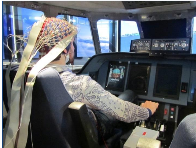
Fig. 1. Illustration of a participant in the flight simulator.

Oddball Sounds. One of two 50 dB (SPL) tone types lasting 100 ms was randomly played. The tone was either standard (frequency = 1900 Hz, p = 0.9 ) or deviant (frequency = 1950 Hz, p = 0.1 ).