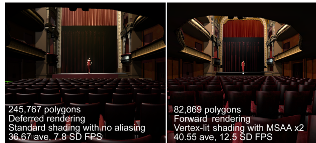
Figure 1: Final render quality. Left:CAVE, Right:GearVR.

this kind of devices. We designed the experiment so that subjects would be confronted mostly by the visual and interaction differences while the auditory variances were almost minimal. Figure 1 shows a comparison of rendering qualities of both environments.