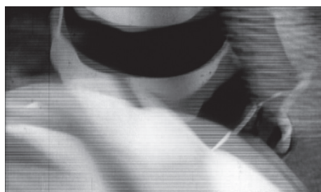
Figure 11.2 Rhythm. From the film Jazz Dance , © Canarybananafilms.

This event took place in 1954, and if we move further in time we could refer to Blow Up (1966), the Antonioni film, which deals with the relationship between the perceiving subject and the perceived object. Without describing the whole film, the story is about a still photographer who, during a photo session in the