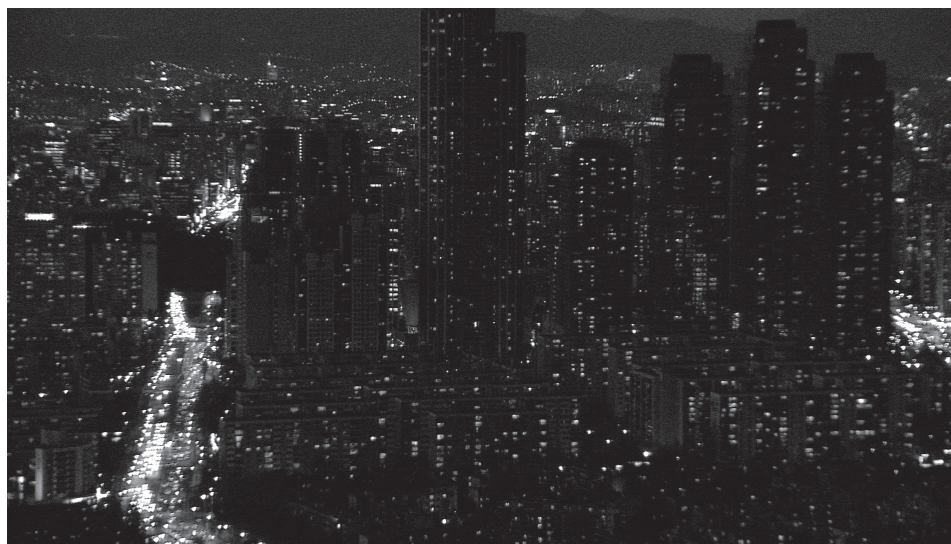
Figure 11.5 Urban folktale in Pixels. Phone Tapping © Hee-won Lee and Le Fresnoy—Studio national.

In this specific case, the programing language introduced us to the pixel as a particular identity but also as an autonomous character. Grain or pixel could be equally perceived as narrative choice. In In The Name of Love , a Michel Leclerc film, there are three different types of film used: first, the fake Super-8 archive images which were intended to match the real Super-8 archive of the Algerian War. Then,