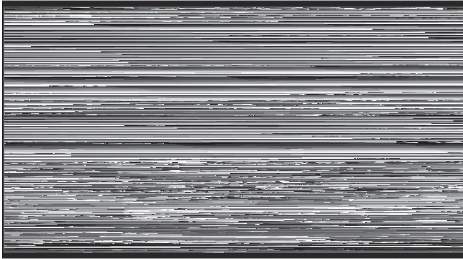
Figure 11.3 The Crawler , © Mapping the Web Infome by Lisa Jevbratt.