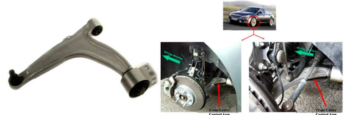
Fig. 2. The front lower control arm.

The production (or pre-consumer) scrap is treated to remove the fluids and dirt and is then reused in the manufacturing of the AA6082 ingot. The aluminium recycling process (post customer scrap) is described in [20].