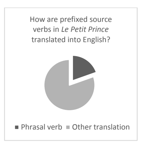
Figure 2. Morphologically simplex versus morphologically complex verbs in Le Petit Prince and the share of phrasal verbs corresponding to them in the English translation

Clearly, when the verb is morphologically complex in the French source text, it is much more likely to be translated with a phrasal verb in the English translation than when that source verb is simplex. The observed difference is statistically extremely significant ( \chi^2 = 39.287 ; p < .0001). Fisher's Exact Probability Test also produces a two-tailed p-value smaller than 0.0001, confirming that association between kinds of source verbs (simplex / complex) and translations (phrasal verbs / other) can be considered to be extremely statistically significant.