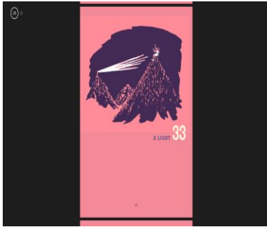
Figure 2: The World is Round , p.27, illustrated by Clement Hurd.

But Hurd obviously understood what was expected of him and designed a book that left room for the uncanny without being too openly aggressive. Stein was able to discuss the project with Hurd and both seem to have been happy with the book. Hurd wrote in May 1939: