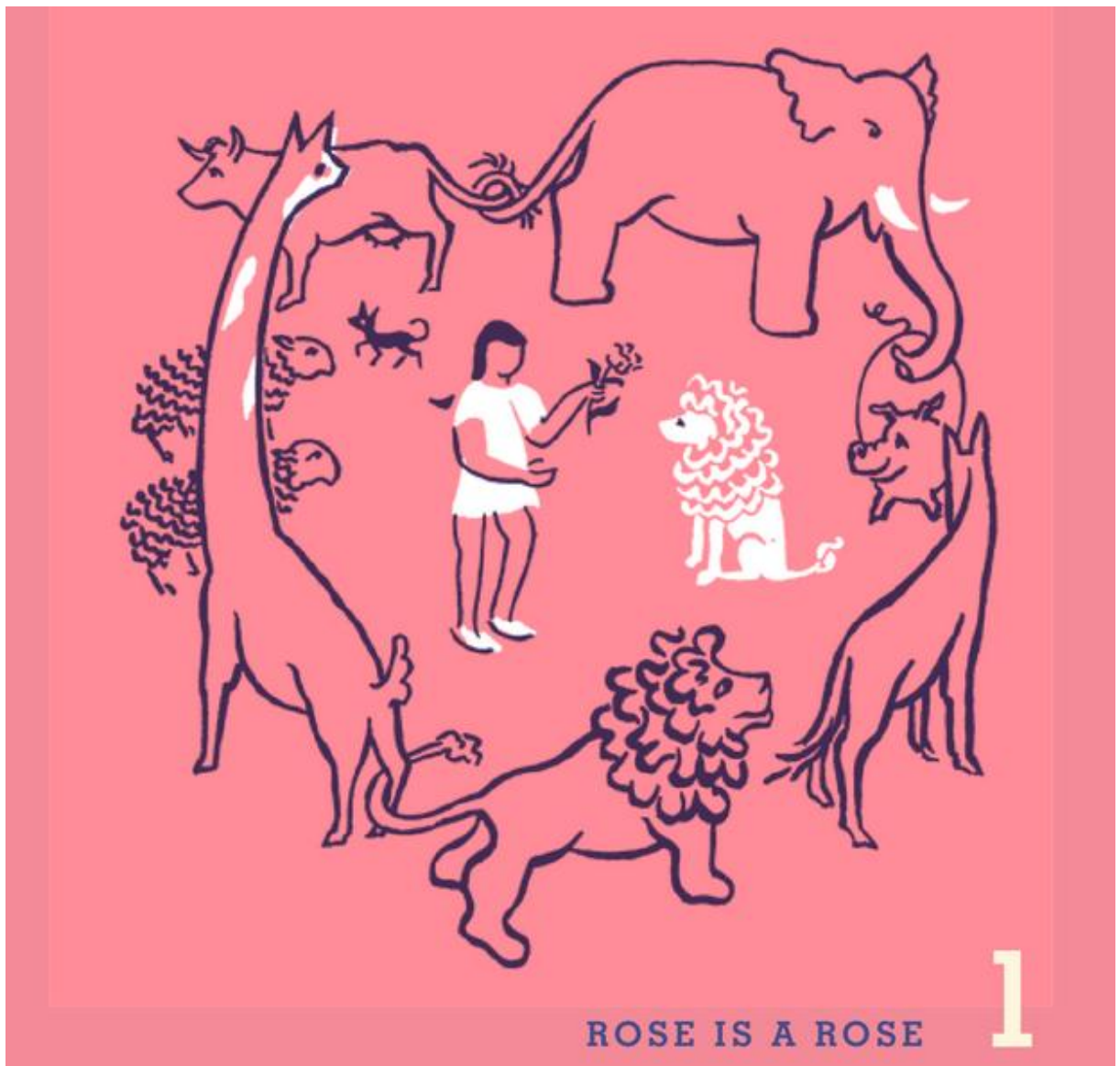
Figure 1: The World is Round , p.3, illustrated by Clement Hurd.

Hurd's rendering of the text remains subtle and intelligent, never ignoring the darker aspects of the narrative nor glossing over them. Some illustrations are actually quite dark (for instance the forest at night, in chapter 20), or even vaguely and symbolically sexual (the lighthouse in chapter 33, with light flashing at Rose, towards the end of the text and her reunion with Willie (fig. 2).