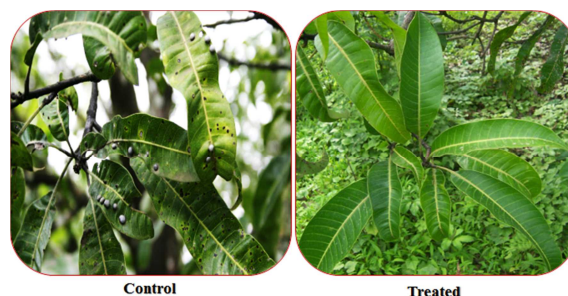
Figure 1. Representative photograph of mango leaves.

Leaves were more in number in the treated plants as compared to the control plants. Apart from leaves, the control mango trees showed an average 8 to 10 inches long flowering pattern with more male flowers. However, the flowering pattern of treated plants was completely transformed into compact one being 4 to 5 inches in length and having more female flowers. Moreover, 50 to 80% of malformation was consistently noticed in the untreated trees (Fig. 2).