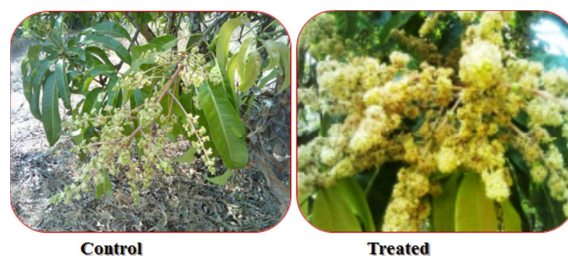
Figure 2. Flowering pattern of Alphonso mango ( Mangifera indica L.).

Clusters of fruitlets were observed in large quantity giving an appearance of 'jhumka' in the control sample. However, no such types of cluster of fruit lets were observed at the tip of the panicles. The weight of natured ripened mango was found on average 275 gm, medium sized with 50% lesser pulp in the control, while the biofield energy treated trees showed on the average weight of 400 gm, large sized and having more than 75% higher pulp.