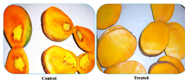
Figure 3. Representative photograph of mangoes with spongy tissue disorder.

After maturation of mangoes, the spongy tissues content were observed in fruit at ripe stage approximately 80% fruits were affected and at 16 anna maturity level about 60% fruits were affected with spongy tissue in control fruit. However, in biofield treated sample at 16 anna maturity stage the spongy tissue disorder was completely eradicated. The representative photomicrograph related to spongy tissues of control and in the treated mangoes are shown in Fig. 3.