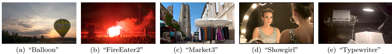
Fig. 1 Original contents for the new proposed image database described in Section 2.5, rendered using the TMO in [34].

are displayed, the observer takes all the time she/he needed to rate the level of annoyance on the same continuous scale as in [59]. The sequence of tested images is randomized to avoid context effects [8]. Moreover, too bright (“Market3”) and too dark (“FireEater2”) stimuli are not placed one after another in order to avoid any masking caused by sudden brightness change. In addition to randomization, stabilizing images (one from each content and featuring each quality level) are shown in the beginning of the experiment to stabilize viewers’ votes (which are discarded for those images).