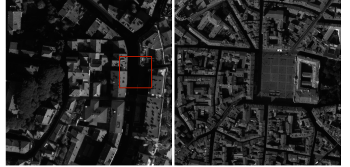
Fig. 1: Images used for the experiments. Both images are 12 bits Pléiades images. The zone delimited by the red rectangle in the Cannes image is the one highlighted in Figure 2.

The previous method requires to estimate a local Gaussian model (\mu_k, \Sigma_k) from a set of nearest neighbors N_k = \{\tilde{P}_m\} such that d(\tilde{P}_k, \tilde{P}_m) < \delta . This set of patches are used to estimate the sample mean and covariances of the local Gaussian models. The metric used to compare patches should be robust to the noise present in the images; the covariance estimation may be ill-posed and may therefore