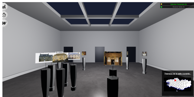
Figure 1. Growing virtual museum

Many works in e-commerce and data exploration focus on finding ways to adapt information representation according to user's center of interest. Almost of these approaches estimate this center of interest from informations consulted during navigation. [10] propose to classify users among three categories : expert, medium, beginner. Each category is associated with a level of information details to be presented to the user, as well as with a specific navigation mode. The system defines and changes the user category by analyzing the information that he consults. [8] present a web site dedicated to scheduling. It allows suggestions according to user's center of interest. These centers of interest are determined from the sites that were previously visited. One similar approach is proposed by Cecilia di Sciascio in [3]. It consists to not only