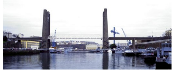
Figure 3. Object characterized by three Dimensional entities : Topos : Brest, Chronos : XX th century, Thema : Bridge