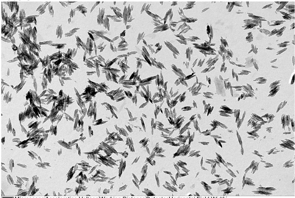
MicroscopeAccelerating VoltageWorking DistanceDetectorHorizontal Field Width 1200EX II 80 kV - - 2,4 µm - 500 nm-