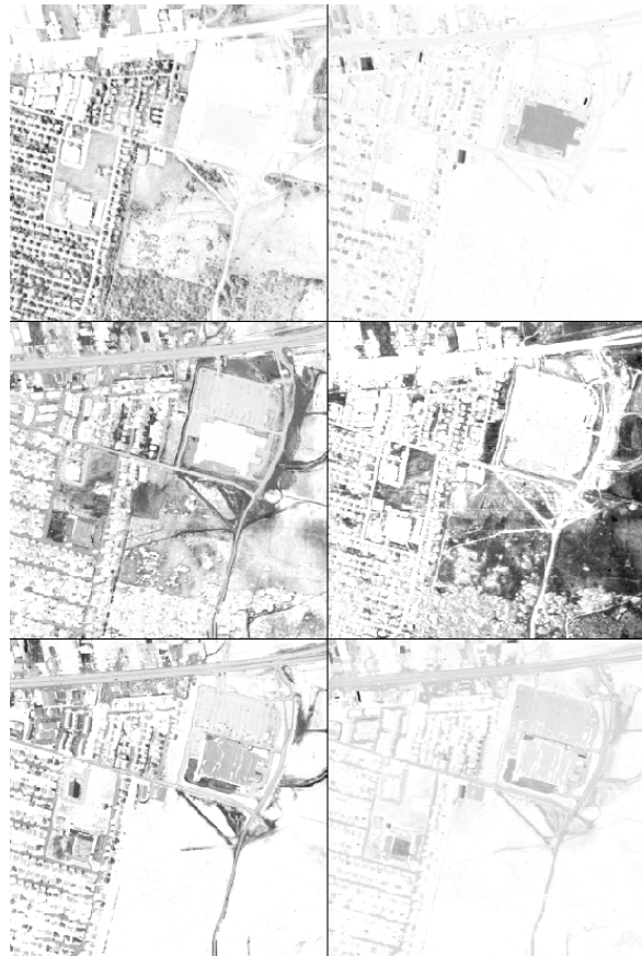
Fig. 2. Abundance maps identified using d-H2NMF for the Urban data set with r = 6 .