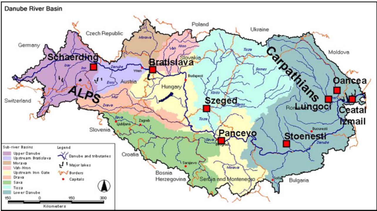
Figure 1. Danube catchment with eight hydrological stations: Schaerding (Inn River), Bratislava (upper part of the main Danube), Szeged (Tisza River), Pancevo (middle part of the main Danube), Stoenesti (Olt River), Lungoci (Siret River), Oancea (Prut River), and Ceatal Izmail (close to the outlet of the Danube) [based on IDPCR ( http://www.icpdr.org/icpdr-pages/river_basin.htm )].

skill forecast scores at various stations representing different hydrologic regimes.