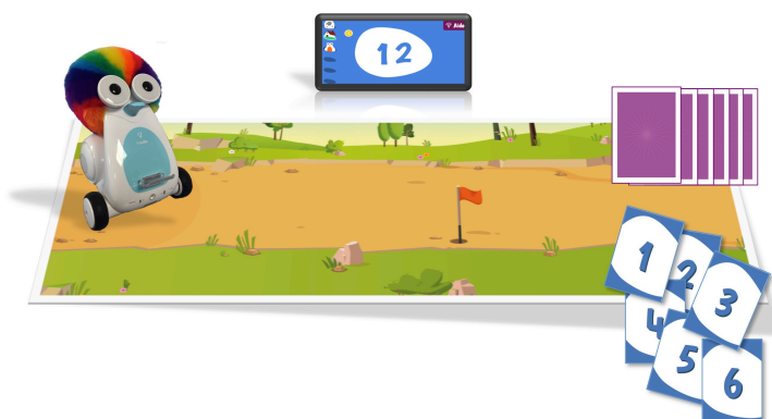
Figure 3. Some of the connected objects of OCINAEE project in scenario “the target number”: moving robot, smartphone displaying the target number 12, game board and sets of cards.

by a digital environment (automatically generated or piloted by a user). We are currently trying to define the different kinds of feedback that such a complex environment can provide in response to students' actions in a learning situation.