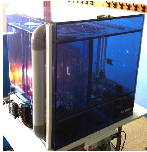
Figure 1: Small-scale experiment of a flat with UFAD regulation

the controlled fans. The excess of air is pushed into the ceiling plenum through exhausts in the fake ceiling and then sent back to the underfloor through a return pipe outside of the flat. Here, the controls at the building level (recirculation, underfloor temperature) are assumed to be set and our focus is on achieving separate climate regulation using decentralized control.