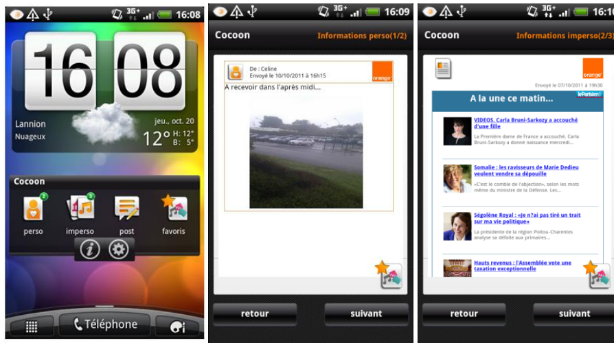
Fig. 2. Cocoon on the HTC Desire S: on the left, the Cocoon widget on the Smartphone home screen; in the middle, a post; on the right, a page of information related to news.

The final version of Cocoon (Fig. 2) was implemented as an Android widget. The Cocoon widget clearly separates personal and impersonal information by two different icons, and gives access to the other features of the system. Information presentation pages look different and offer different possibilities depending on information type (for instance, downloading an item attached to post, accessing to the website of a news provider).