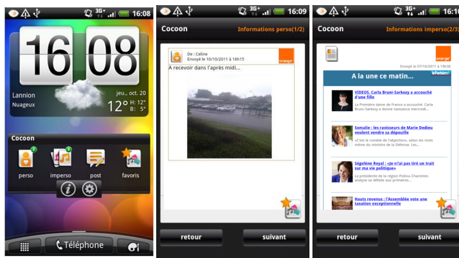
Fig. 2. Cocoon on the HTC Desire S: on the left, the Cocoon widget on the Smartphone home screen; in the middle, a post; on the right, a page of information related to news.

The final version of Cocoon (Fig. 2) was implemented as an Android widget. The Cocoon widget clearly separates personal and impersonal information by two different icons, and gives access to the other features of the system. Information presentation pages look different and offer different possibilities depending on information type (for instance, downloading an item attached to post, accessing to the website of a news provider).