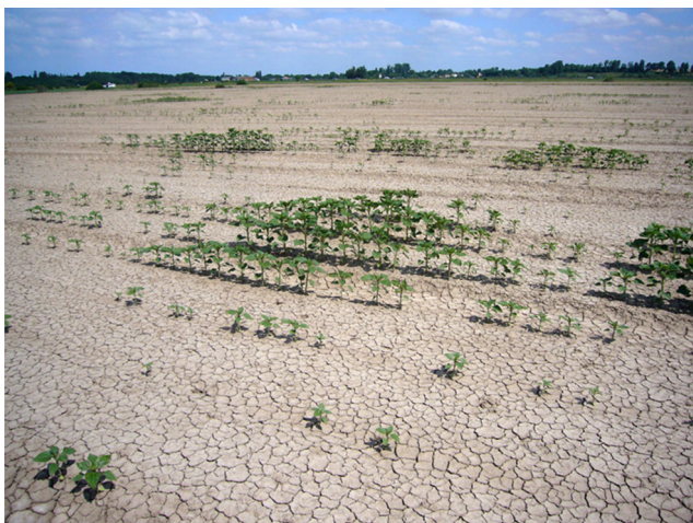
Fig. 1 Agricultural systems are facing multiple and unpredictable perturbations. The impact on a sunflower field of salted sea water flooding induced by Xynthia storm in 2010, in Rochefort area (France).