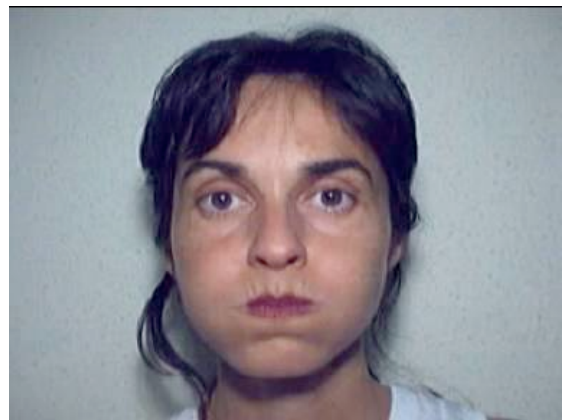
Facial movement (puff out cheeks)