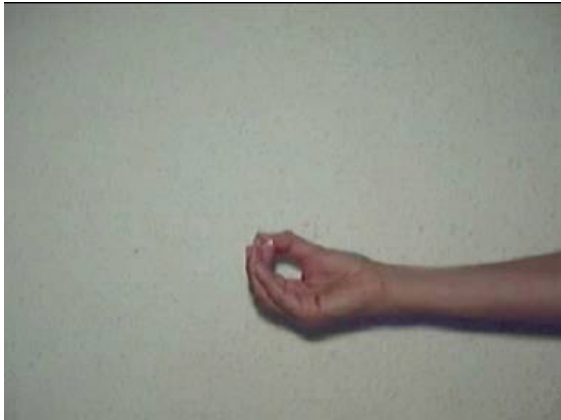
Hand movements (thumb touches all the other fingers simultaneously)