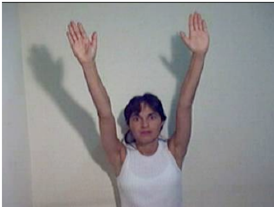
Arms movement (raise arms above head)