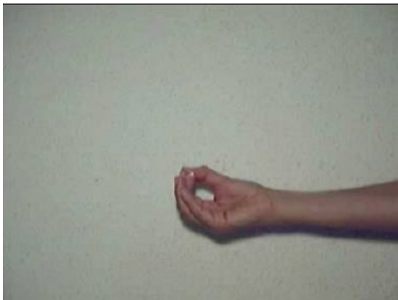
Hand movements (thumb touches all the other fingers simultaneously)