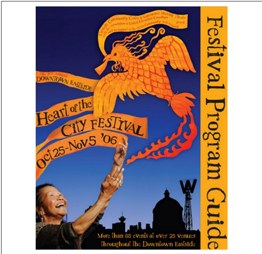
Figure 1. The phoenix illustration.