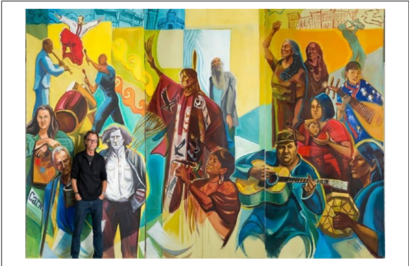
Figure 3. The Gathering.

with their individual/collective memories and dreams to the Festival's ongoing making of the neighborhood's identity. This is well reflected in the words of an interviewee: