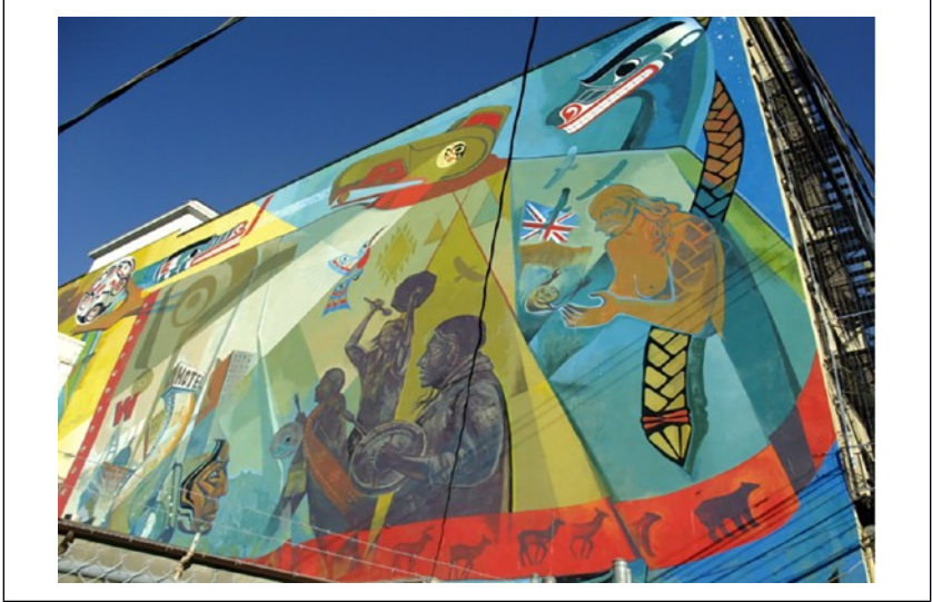
Figure 2. Through the Eyes of Raven.

people, coastal ecosystems, and colonialism, and also demonstrates the strength of their ancestry, as well as contemporary urban Aboriginal events.