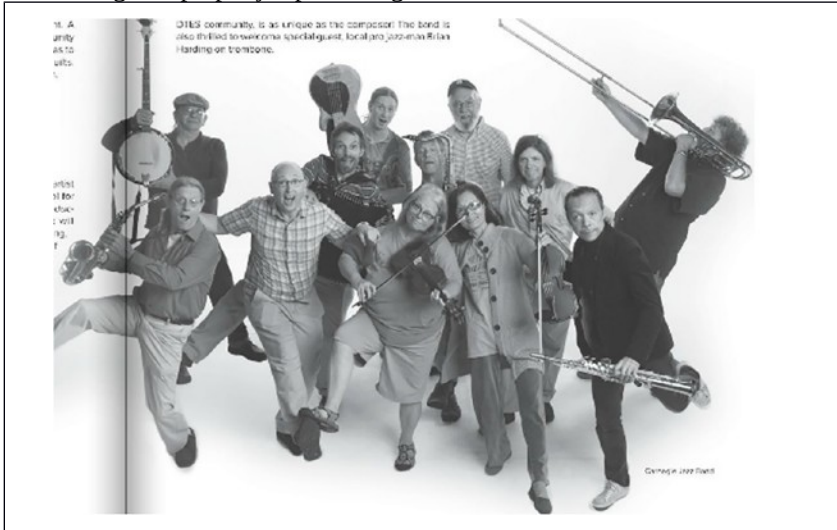
Figure 4. Carnegie Jazz Band.

communication of ideas because they “convey layered and concretized, personalized messages, connotations and metaphors and to arouse strong feelings” (Hamilton 2012, 48). Terry Hunter emphasized the importance of visual images in properly representing the DTES and its residents: