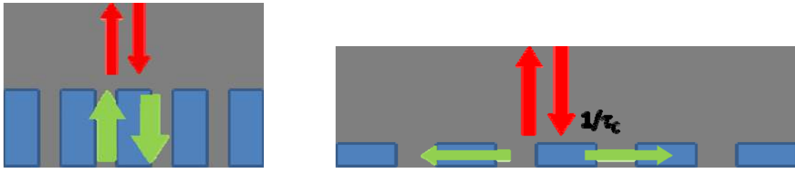
Figure 2: two approaches to understand the physics of PCMs: left: “Fabry-Perot” approach, right: “guided mode” approach

the requirements of a given application. It is therefore of prime importance to establish the physical rules which govern the lifetime of photons in these resonant modes.