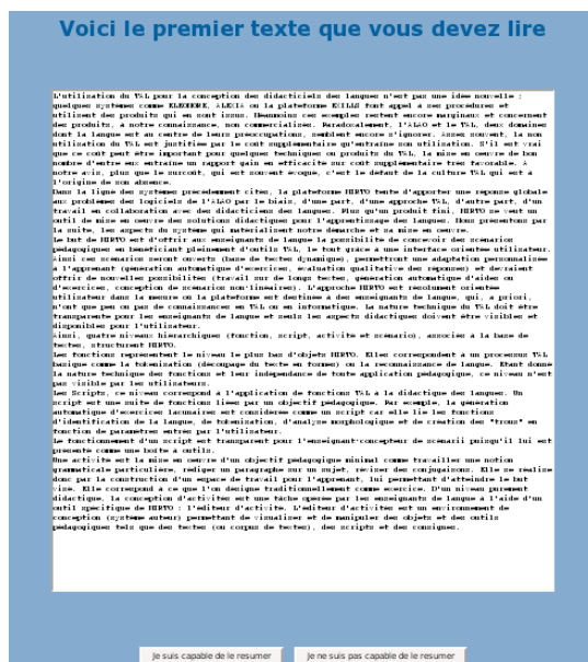
Figure 4 — The interface for reading course texts. Once the text has been read, the student can assess his or her own comprehension: “I can summarize the text” or “I cannot summarize the text”.

Once the text has been read, the student indicates whether it is understood or not, and whether he or she is able to summarize it (see Figure 4). During this step, the learner model is updated, indicating whether the text is summarizable. Apex 2.1 gives texts to read as long as there is no summarizable text yet and texts sufficiently close to the query but not delivered yet. On the contrary, Apex 2.1 suggests the student to perform a new query.