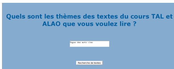
Figure 3 — A message starting the reading loop, asking the student to type some key-words: “What is the course topic you want to read?”

Let us explicate the reading loop . A session typically starts when a student types a query, i.e., some key-words related to the subject domain or the theme he or she wants to be acquainted to (see Figure 3). Then Apex 2.1 displays the student a first text to read, which is the closest text to the query. All the texts are presented to the student successively and are the closest to the query possible, as indicated by LSA. The learner model is updated accordingly, indicating that a given text has been actually presented and read.