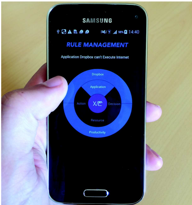
Fig. 3. Implementation of Kapuer : Rule management

details regarding the calculations of user's preferences. More explanation about our problem solving model can be found in [2], [3].