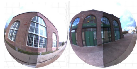
Fig. 4. Fisheye camera images projected and aligned onto the unit sphere

The results show that the orientation of the right fisheye camera rotate about y-axis of 180^\circ . Assuming that both cameras have the same optical center, the translation obtained is neglected and both images from left and right fisheye cameras are projected onto a unit sphere to obtain an Omni-vision of the scene as shown in fig. 4. The extrinsic parameters of the depth camera are obtained using a method described in [6]. The omni-vision system is considered as a single view