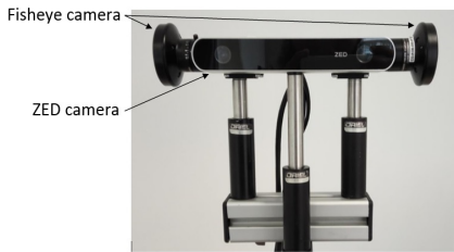
Fig. 3. Proposed omni-vision camera rig.

Our proposed system is a combination of two fisheyes and stereo vision camera. The two fisheye cameras with FoV of 185^\circ are fixed back to back. Thus, they cover the whole scene at once. A depth camera, namely ZED Camera is placed at 90^\circ to the right fisheye camera, allowing the system to observe the frontal view at higher resolution, with the depth information for each pixel of the image. Fig. 3 shows the proposed omni-