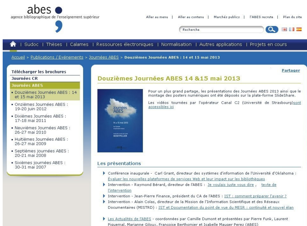
Figure 2: JABES 2013 Web page