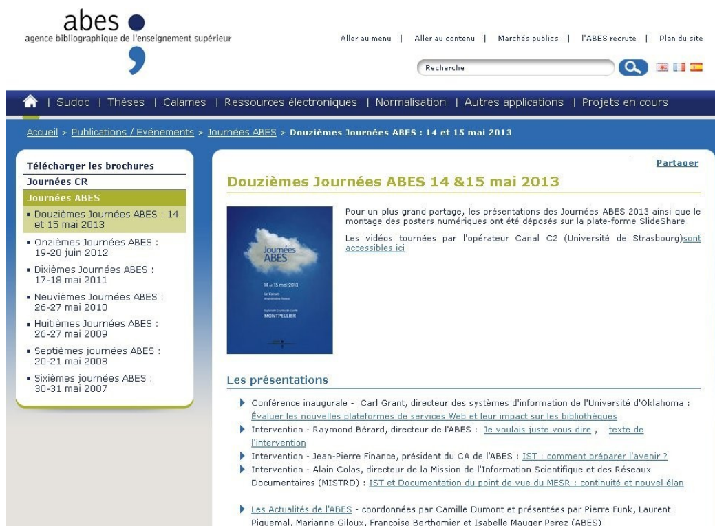
Figure 2: JABES 2013 Web page