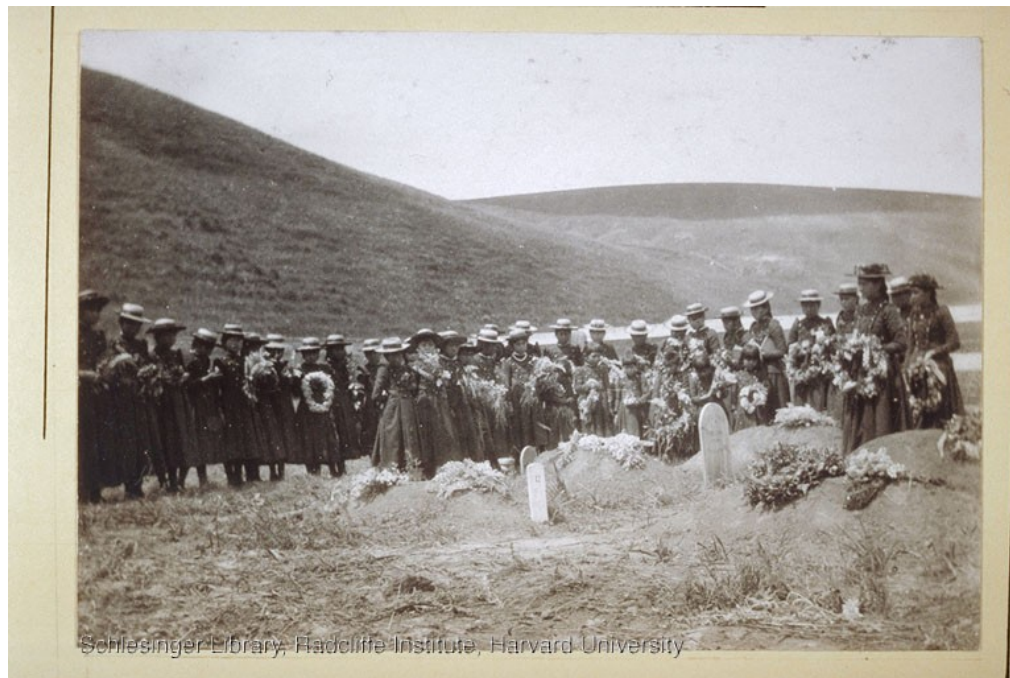
Harvard University, Schlesinger Library on the History of Women in America, 20036074_1