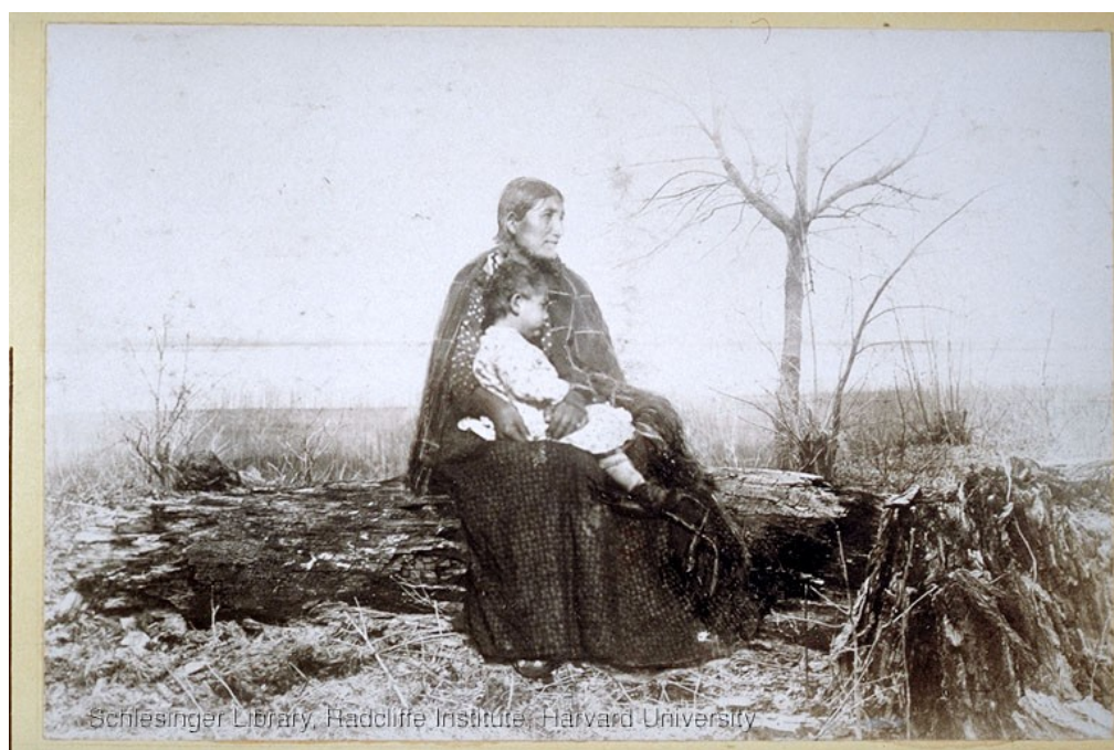
Harvard University, Schlesinger Library on the History of Women in America, 20036065_1