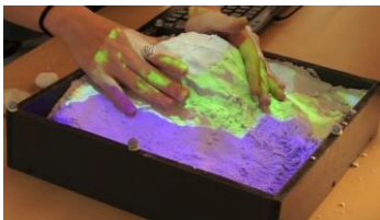
Figure 3: Inner garden , a world in miniature that evolves according to the user's inner state.

Graphical User Interfaces (GUI), restricted to desktop computers. Nowadays, computational devices such as notebooks, smartphones and tablets are ubiquitous. These devices allow us to access powerful and flexible applications whenever required, but these applications still live on a different —virtual— realm, and can only be reached through special windows — screens — that require an interaction approach that greatly differs from our experience on the real world.