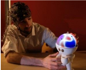
Figure 1: Teegi (tangible EEG interface) enables to explore our brain activity in real time.