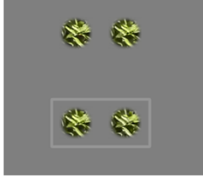
Fig. 1. Screen shot of the software used for MLDS

by linear regression using limited set of dynamic texture features.