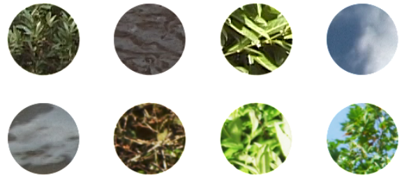
Fig. 2. Sequences used for subjective test

Finally, in the subjective test, the viewers were shown only the inner circle of 91 pixels diameter. Upon the end of each sequence, it was repeated with time reversal in order to avoid temporal flickering artifacts. The sequences are shown in Fig. 2. For clarity, each video was assigned to a SeqId from 1 to 8, which follows the same order as shown in the figure (from left to right, and top to bottom).